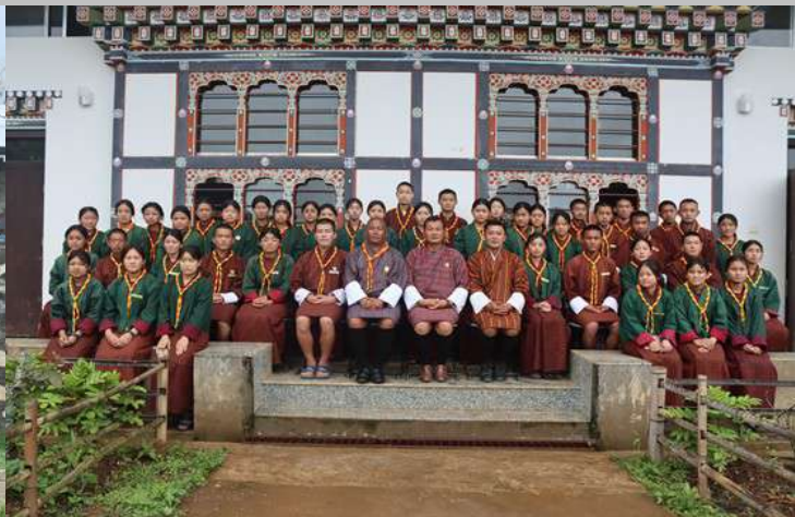
Kengkhar Middle Secondary School