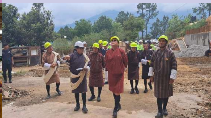
Health Minister, site visit to MCH Construction, Ridaza