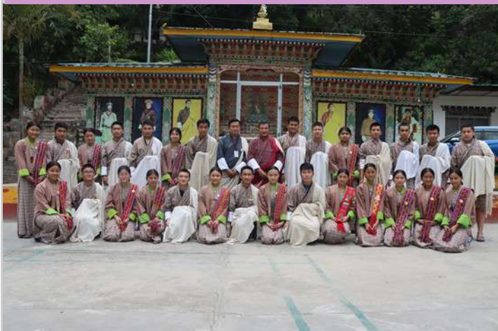
Lingmethang Middle Secondary School