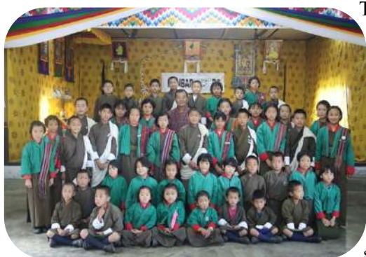
Konbar Primary School

The Dzongdag recently completed a successful series of school visits across the Dzongkhag, designed at promoting student well-being, academic excellence, and strong moral values. Dzongdag was accompanied by DEO and HRO from the Dzongkhag Administration. A key focus of the visit was to sensitize students on the dangers of drug and substance abuse, where the Dzongdag spoke candidly about the severe impact of addiction on health, academic performance, and future prospects. Emphasizing the role of discipline and values in shaping responsible citizens to lead the country in the future, the Dzongdag urged students to cultivate habits of respect, punctuality and integrity.