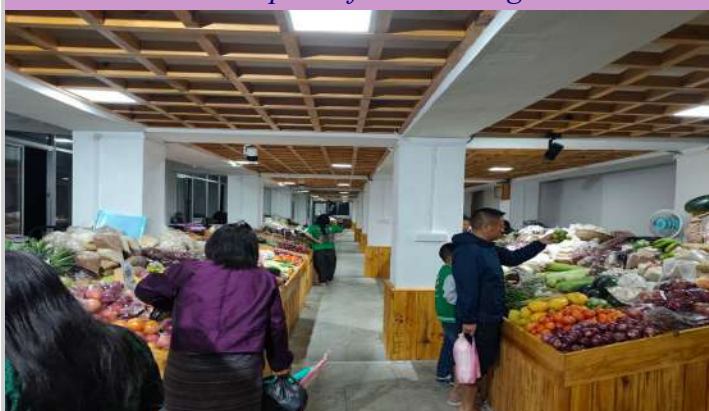
Modern Mongar Vegetable Market