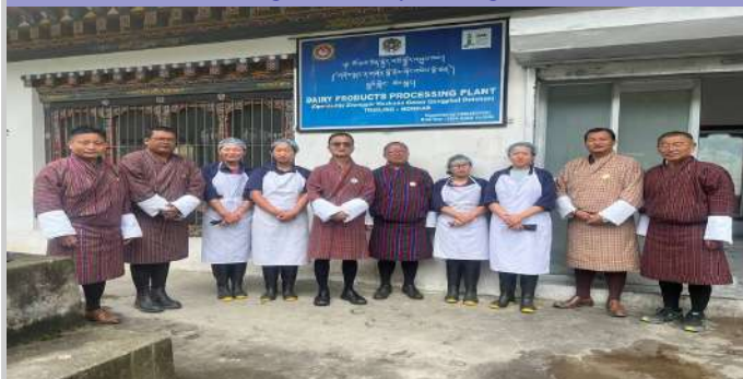
MoAL Secretary visit to Yogurt Centre