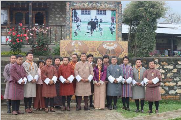
Zunglen Primary School