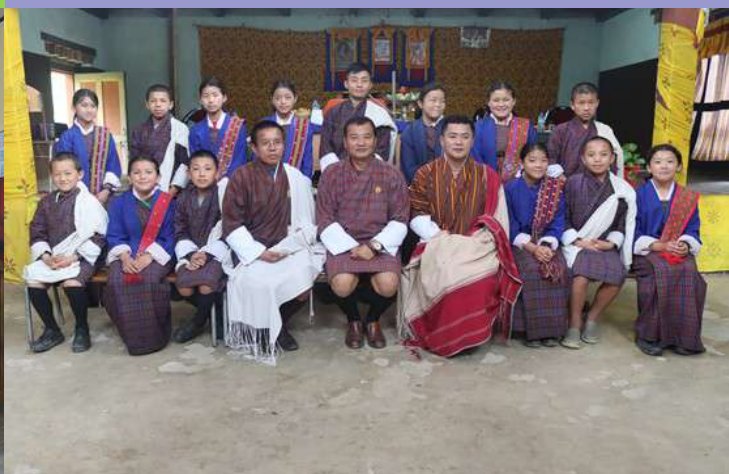
Yuldarig Primary School

Visit to Schools as part of the Educational Reforms