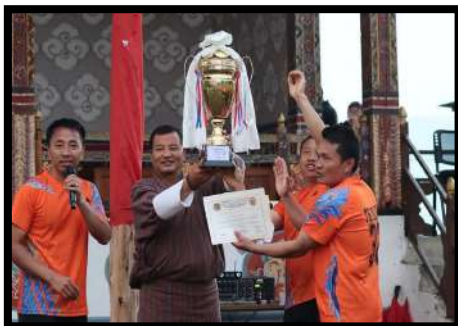
Winner-Mongar Middle Secondary School

maraderie among the school communities. It served as a platform to promote sportsmanship and mutual respect,