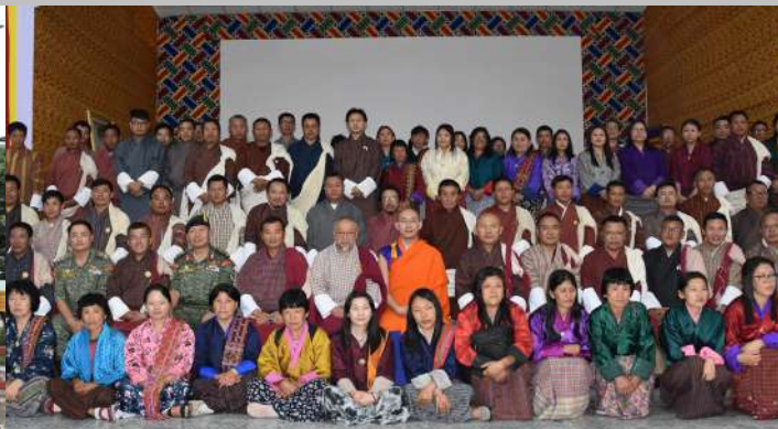
Dorjilung Hrodro-Project Meeting