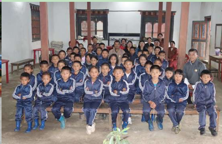
Bumpazor Primary School