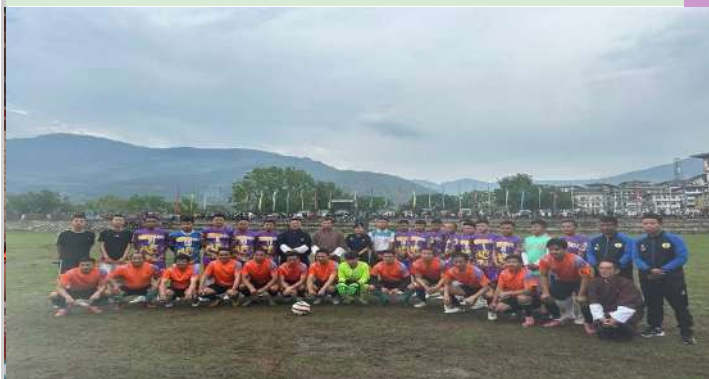
MMSS – Champion of 2025 Sherig Football