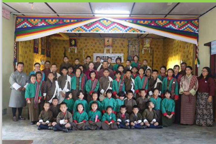
Koenbar Primary School