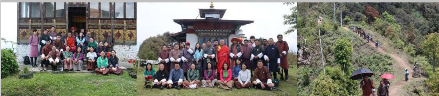
Health Walk from Phujurlabtsha to Pongchula