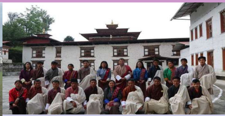
MoAL Secretary visit to Yogurt Centre