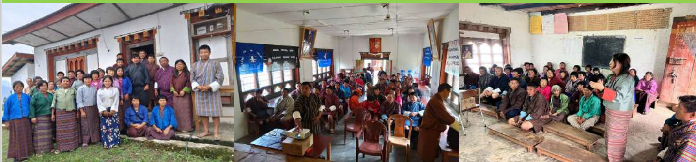
NDI on-boarding at 15 Gewogs