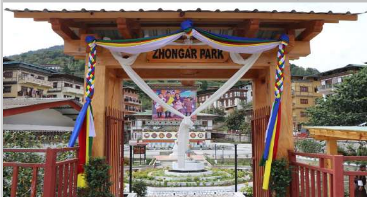
Inauguration of Zhongar Park