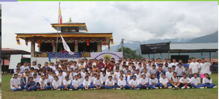
66 th Foundation Day & Annual Sports' Day, MHSS