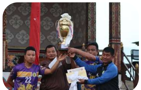
Runner's Up-Drameitse Central School

Tournament" for school staff. The tournament, which ran from April 12 to May 11, 2025, saw active participation from staff of MMSS, MHSS, CMSS, KMSS, GMSS, LMSS, KHSS and DHSS. This inter-school initiative