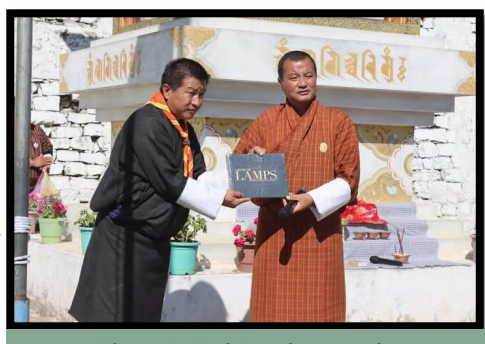
Ridaza Principal & Dasho Dzongdag

scores and the broader goal of enhancing the overall quality of education.