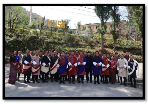
the growing prevalence of tobacco and mostly the consumption of alcohol in both urban and rural areas.