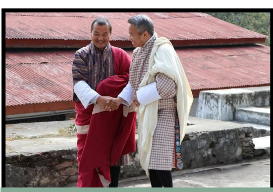
Hon'ble RCSC Commissioner Dasho Baburam Sherpa

Commissioner. Dasho Ba- session buram his met