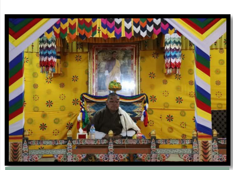
Hon'ble Election Commissioner Dasho Dawa

On March 23, 2025, phasized Bhutan (ECB), led ernment with by Hon'ble Election representatives Commissioner,