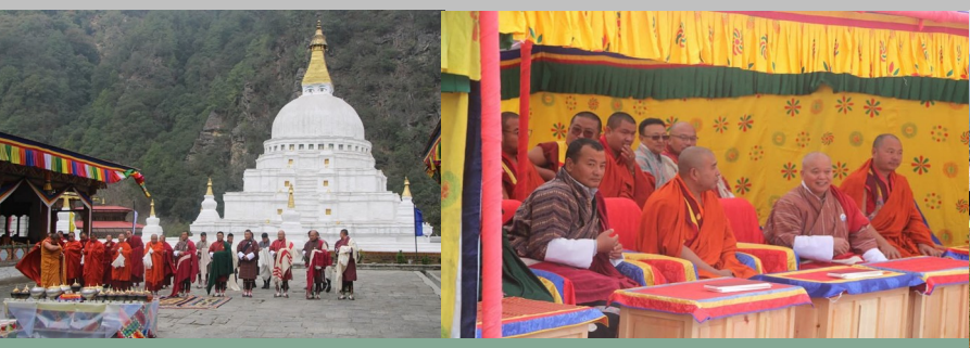
Meonlam Chenmo Committee attending Trashiyangtse Dzongkhag Meonlam Chenmo