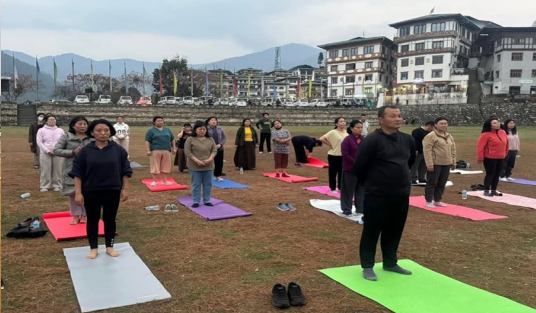
Dasho Dzongdag & Staff participating in aerobic exercise, Zhiney & Luejong Program