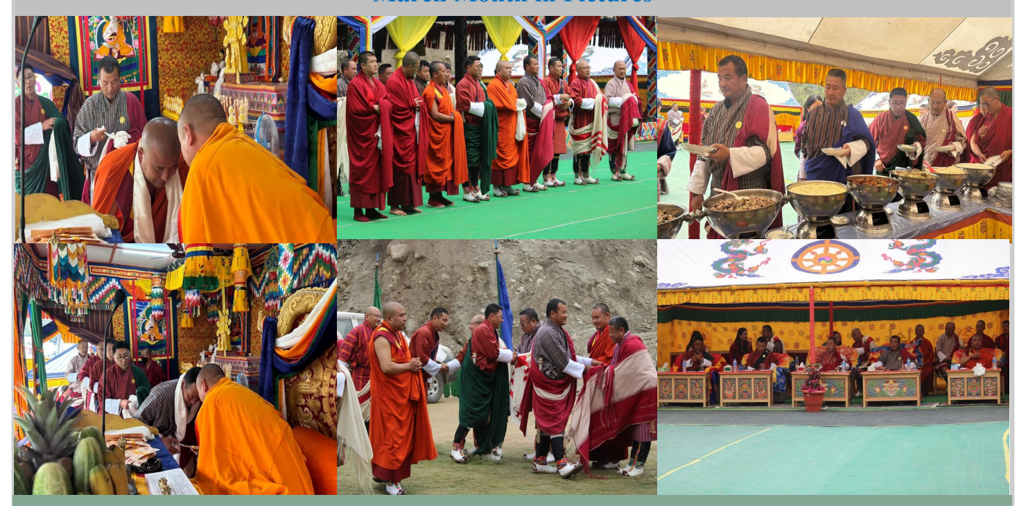
Mongar Dzongkhag Meonlam Chenmo Committee attending Pemagatshel Dzongkhag Meonlam Chenmo