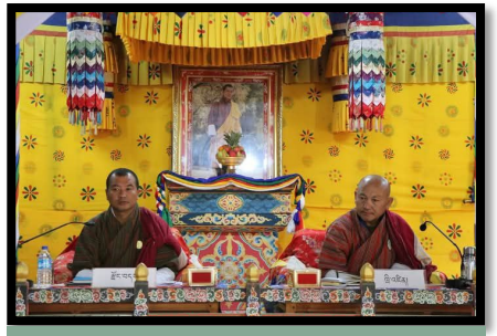
Dzongkhag Tshogdu Thrizin & Dasho Dzong-

khag Tshogdu of the 3<sup>rd</sup> Local Government took place from March 10<sup>th</sup>