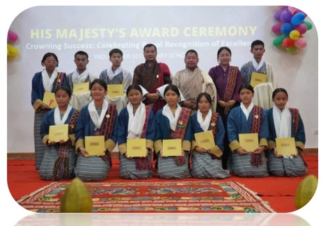
Awarding HM's Certificates of Excellence, October 2024