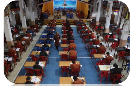
Trial Examinations begins in mid-October 2024