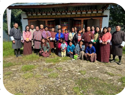
Contributed by: Agriculture Office

the activities under CARLEP in the eastern region (19 th to 30 th Oct, 2024). The team engaged with local communities, assessed agricultural initiatives, and discussed sustainability strategies for ongoing community development. They interacted with women's vegetable farming groups of Laptsa, Drepong, observing their practices and gathering insights on their challenges and successes. The team also visited sites involved in land improvement projects. The team explored mushroom production