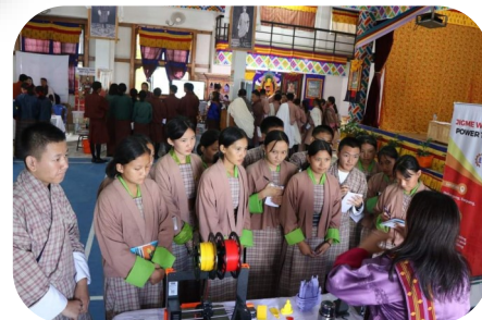
Contributed by: ICT Office

Educate Fair Booth Exploration for parents, jobseekers, and dropouts in the presence of DASHO DZONGDAG, Sector Heads, teachers, and the students of Mongar Dzongkhag at Mongar Higher Secondary school. This fair serves as an excellent opportunity for the youth, students,