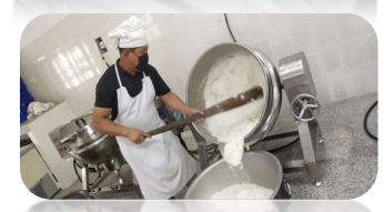
Contributed by: Education Office