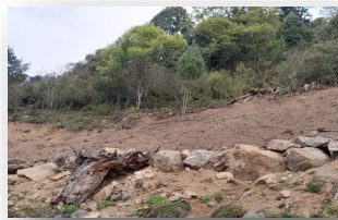
After Land Development