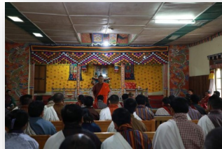
Contributed by: Planning Office

rected to develop detailed strategies to enhance economic growth, ensure the quality of public infrastructure nationwide, improve academic performance in schools, and formulate robust plans to promote tourism. His Excellency added that in the 13 th Plan, each district will focus on maximizing its GDP. He said that in doing so, the government plans to raise the per capita income of every citizen throughout the country.