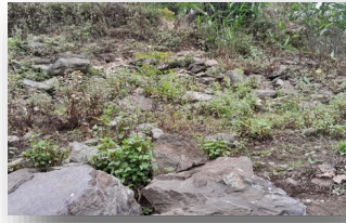
Before Land Development

ders, as well as leveling the terrain for agricultural purposes.