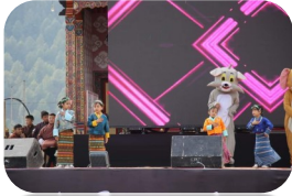
Dancing and Singing Performances