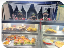
Fast Food Stall